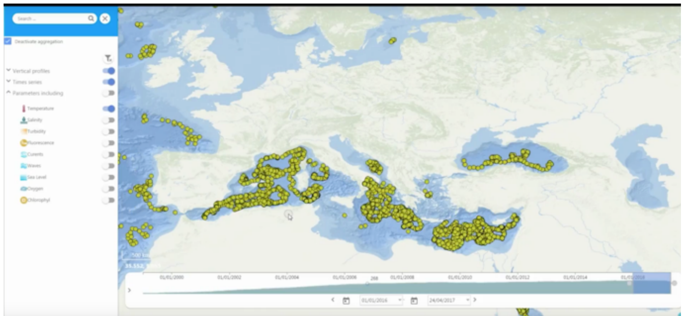
Figure 2. DSS Web portal