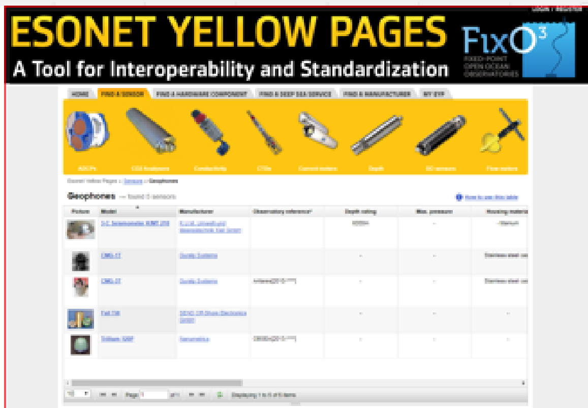
Figure 10. Sensor Deployment Graphical Editor and Sensor Model Database for EMSO